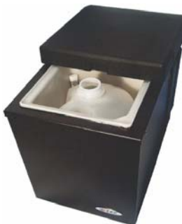
Optional MilkMate Refrigerator