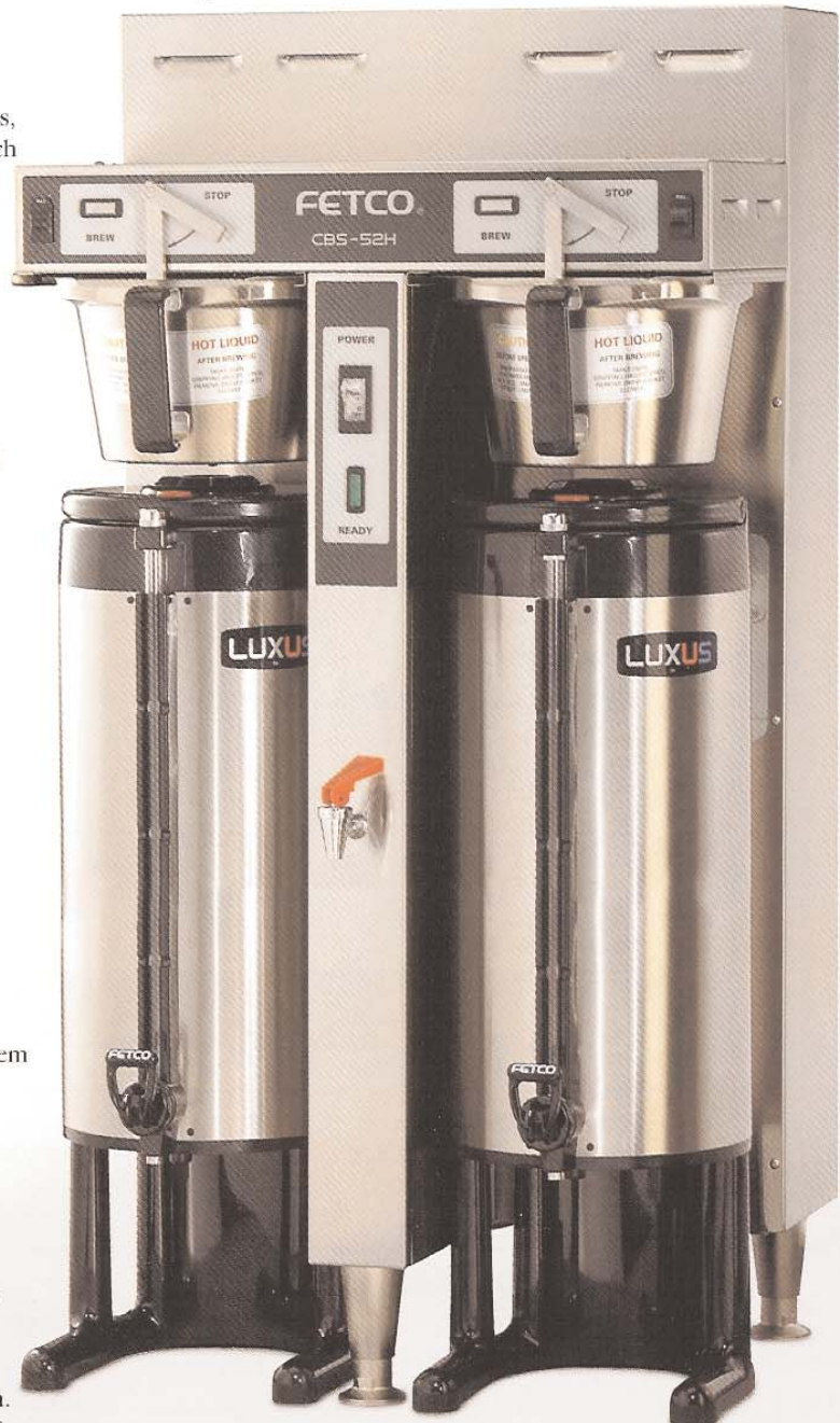
CBS-52H20 in Stainless Steel finish and with 2.0 Gallon LUXUS Dispensers

You can prepare them ahead of time and place them where you want them. It is important to note that the LUXUS thermal dispenser can be staff-operated or used as a self-service system