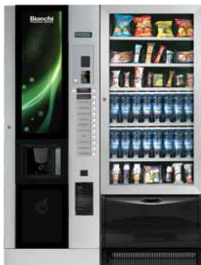
LEI 600 PP + VISTA L